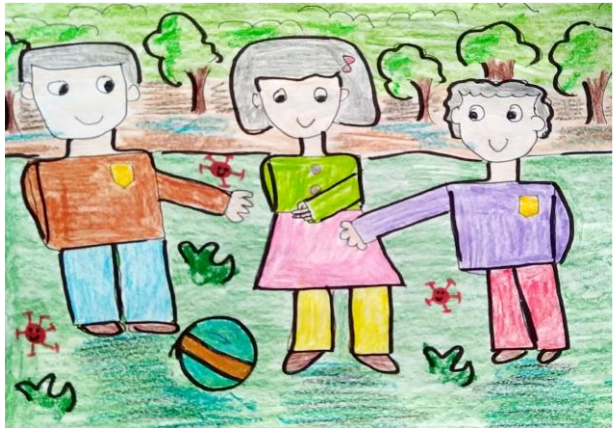
An illustration by Farnaz Amjad